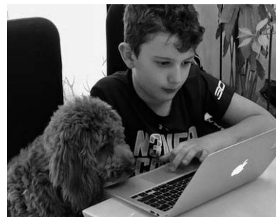
When learning remotely, students were challenged to find the perfect workspace at home.

During remote learning, students receive instruction via three primary means: through carefully crafted assignments housed in Google Classroom