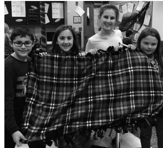
Along with safety patrol, student government is a place where students can work to make the world a better place --- here by making blankets for care facilities.