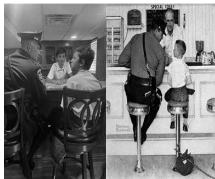
Students were encouraged to stretch their creativity, such as by recreating live versions of famous artwork.

Students don't just receive instruction in the core contents subjects such as language arts, mathematics, science and social studies, they also receive assignments to complete in art, music, library, world language, physical education and technology. It's through these assignments where we've seen our students' creativity shine, whether they were finding objects around the house to create a color wheel, sketching their own house, or creating a digital song. Students also have opportunities throughout the week to talk with their class or in small groups with the school counselor about their emotional well being as we recognize that the whole child was impacted by this quick transition.