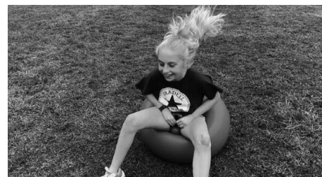
A favorite day for every OPS student!