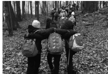
Sharpe is a favorite experience of most OPS students as the class unites forming lifelong memories.