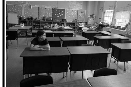
As our 6th graders say goodbye, they carry with them the OPS spirit.