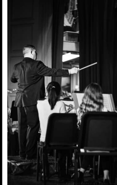
Our music program develops the whole child.