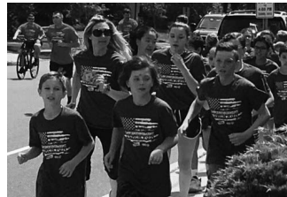
The Torch Run benefiting Special Olympics is one of the many Special Events our students participate in each year.